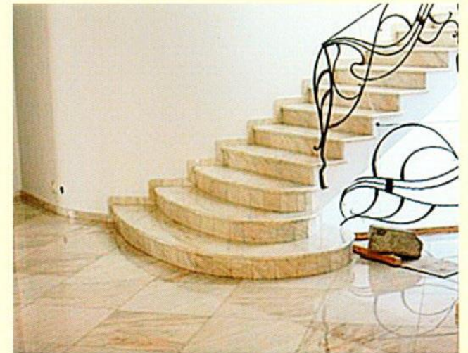
Architectural and construction elements